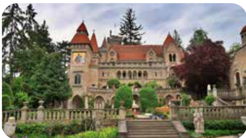
Castle Bory, Székesfehérvár