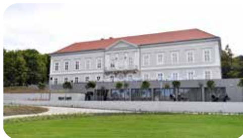
Hunters Mansion, Bodajk