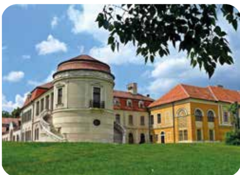
Mansion in Iszkaszentgyörgy