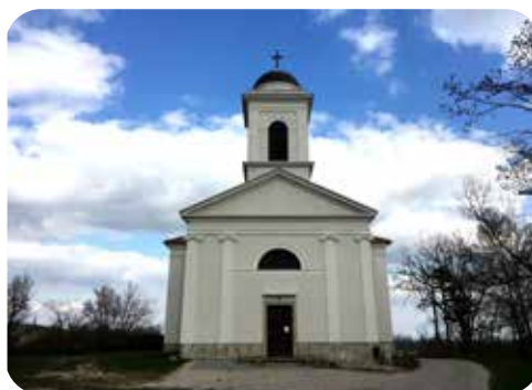
Catholic church in Iszkaszentgyörgy