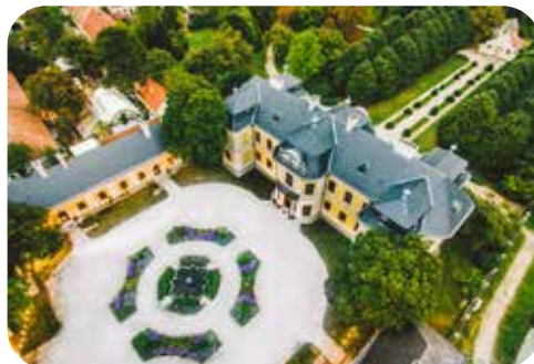
Lamberg Mansion, Mór