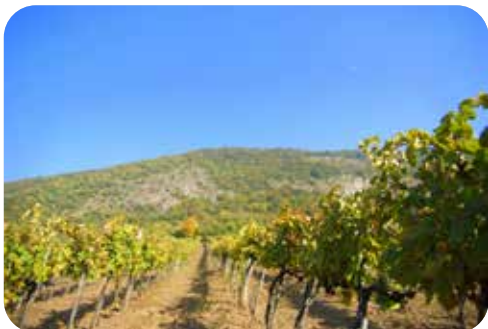
Wine cellars at Mór